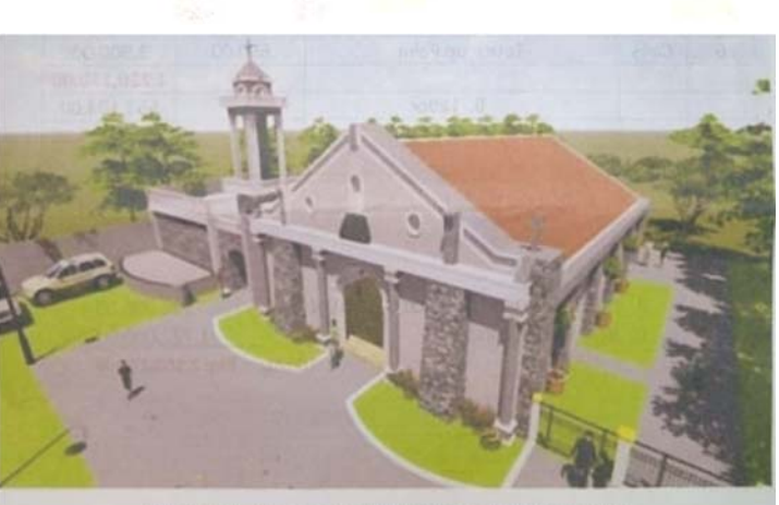
This is the CHURCH NEW ROOF PERSPECTIVE